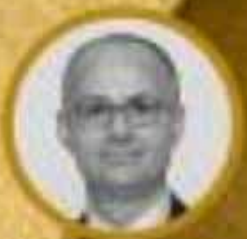
Omar M. Yaghi